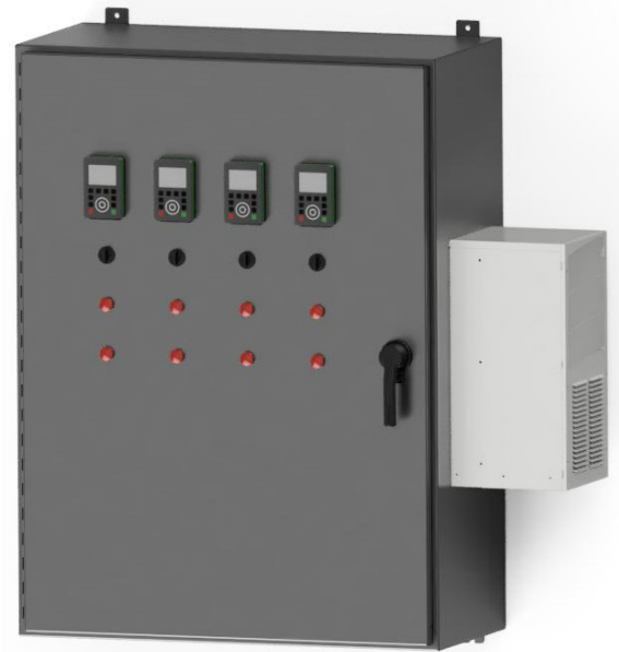
VFD Control Panel - 3D enclosure layout

Our goal will always be to gather all necessary information and customer objectives. We apply knowledge of the latest products into a design to help optimize your efficiency, productivity and profitability all while minimizing your total cost of ownership. Their work and customer testimonials support this highly detailed team. Our approach is to create a partnership for your success .