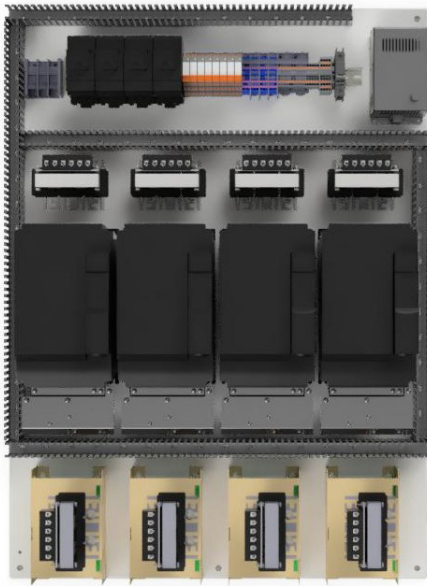
VFD Control Panel - 3D back panel layout